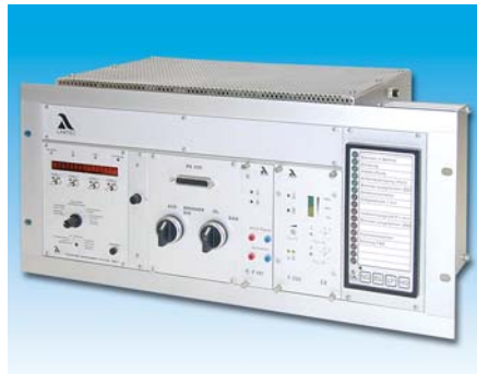
Compact burner control system in acc. with TRD 604-72hr