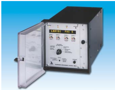
FMS Firing Management System VMS Compound Management System