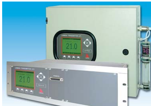
LT1 O 2 - Transmitter