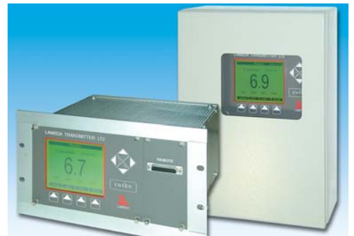
LT2 O 2 - Transmitter

Universal O 2 - measurement device for firing installations of all types, based on the LS 1 and LS 2 Lambda Probes, for connecting several probes.