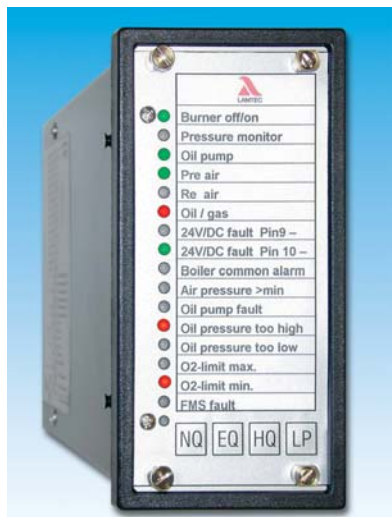
New Value-, First Value- Operation- and Alarm-Indicator System NEMS 16