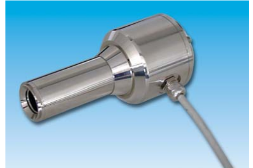
F 200K Compact Flame Detector

Infrared (IR); ultraviolet (UV); ionisation (IO)