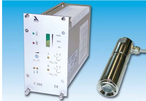
F 250 Flame Detector