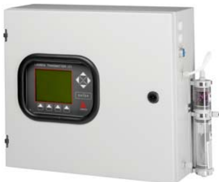
Fig. 1 Lambda Transmitter LT1 in wall mounting housing