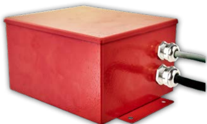
Steel or sheet steel housing with control unit