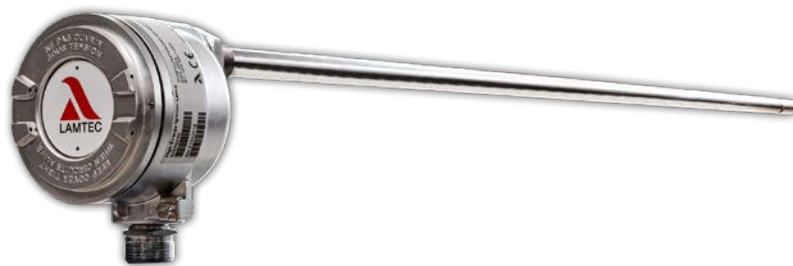
Cast steel housing with control unit and ignition lance