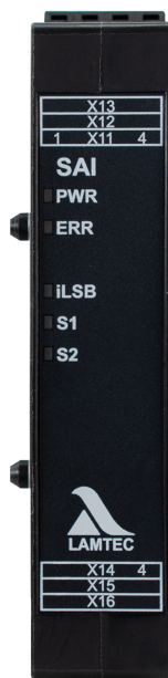
Fig. 1