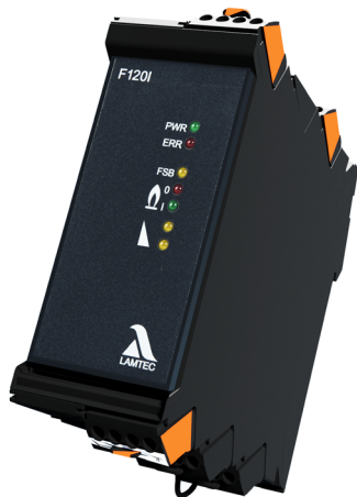
Fig. 1 F120I