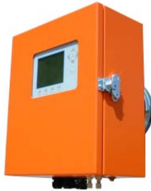
Fig. 1-1 LT10 ...