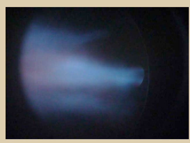
Flame without cooling of flame.

The air enriched with water is burned in the boiler together with the gas. The high water content in the suction air, which can reach up to 150 g of water per kg of dry air, causes a change in the colour of the burner flame. When the system is switched on, a change in the colour of the flame to a more orange shade is recognisable via the LAMTEC burner control. In addition to the main flame, a pilot burner works in continuous operation to support the main flame.