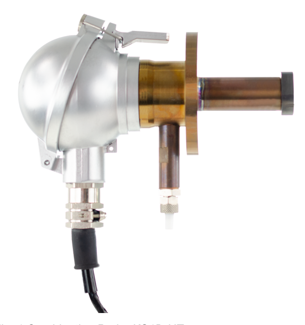
Fig. 1 Combination Probe KS1D-HT