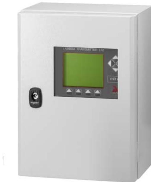
Fig. 1-1 LT2 in wall-mounted housing