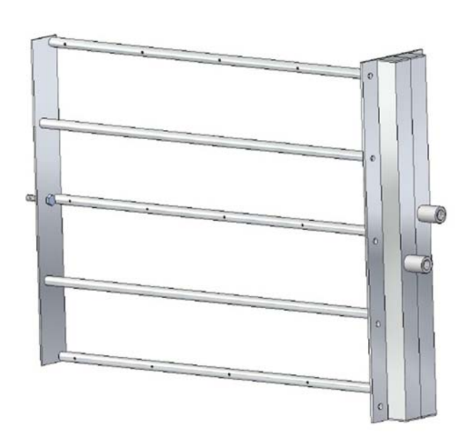
Fig. 2 Example of mass flow measurement grid in rectangular design with flange