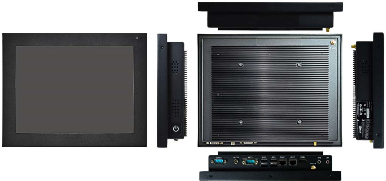
Fig. 1 Views GKI300