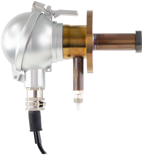
Fig. 1 Lambda Probe LS2-HT