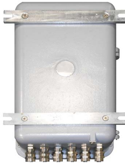
Fig. 1 EExd housing for LT2 for installation within the hazardous area - Fig. 2 Back view EExd housing