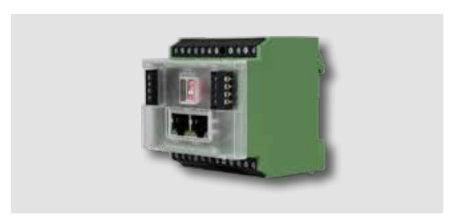
EBM112 ProfiNet module.