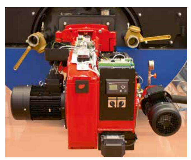
BT320 mounted on a burner.

Tronic BT300 can meet most burner control applications and is scalable allowing modules, such as VSD fan control and {\rm CO/H_2} control, to be added later to enhance functionality when requirements change.